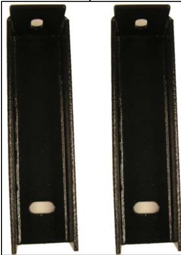
Passenger/Driver Rear Mounting Brackets