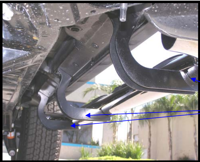
FIG. #2 DRIVER SIDE SHOWN