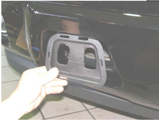
Fig 1 (Passenger Side)