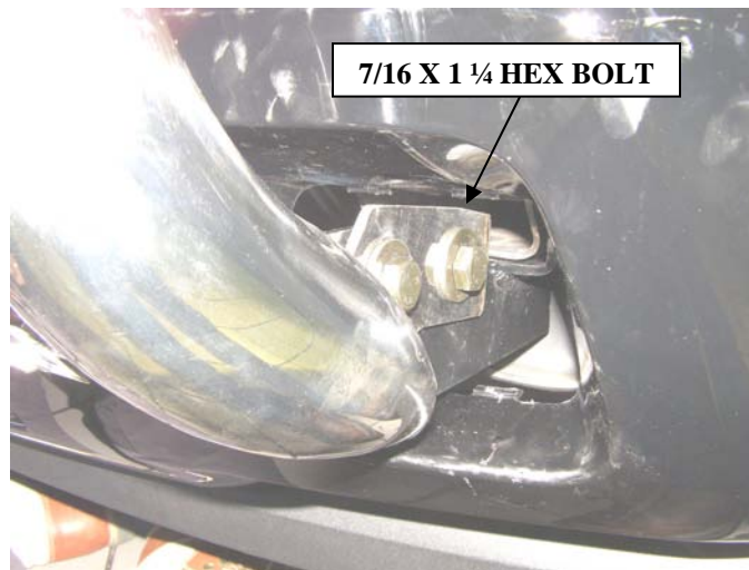
Fig 3 ( Driver Side)